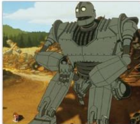
The Iron Giant