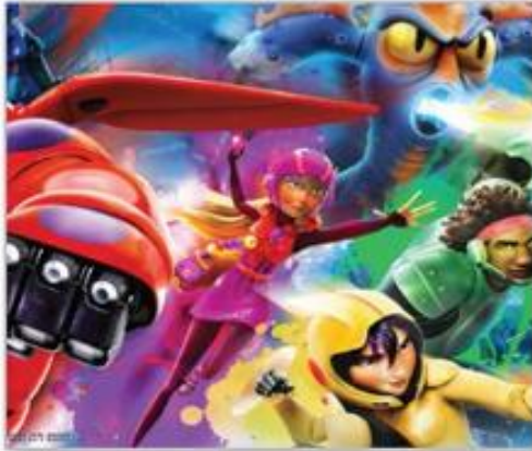
Big Hero 6